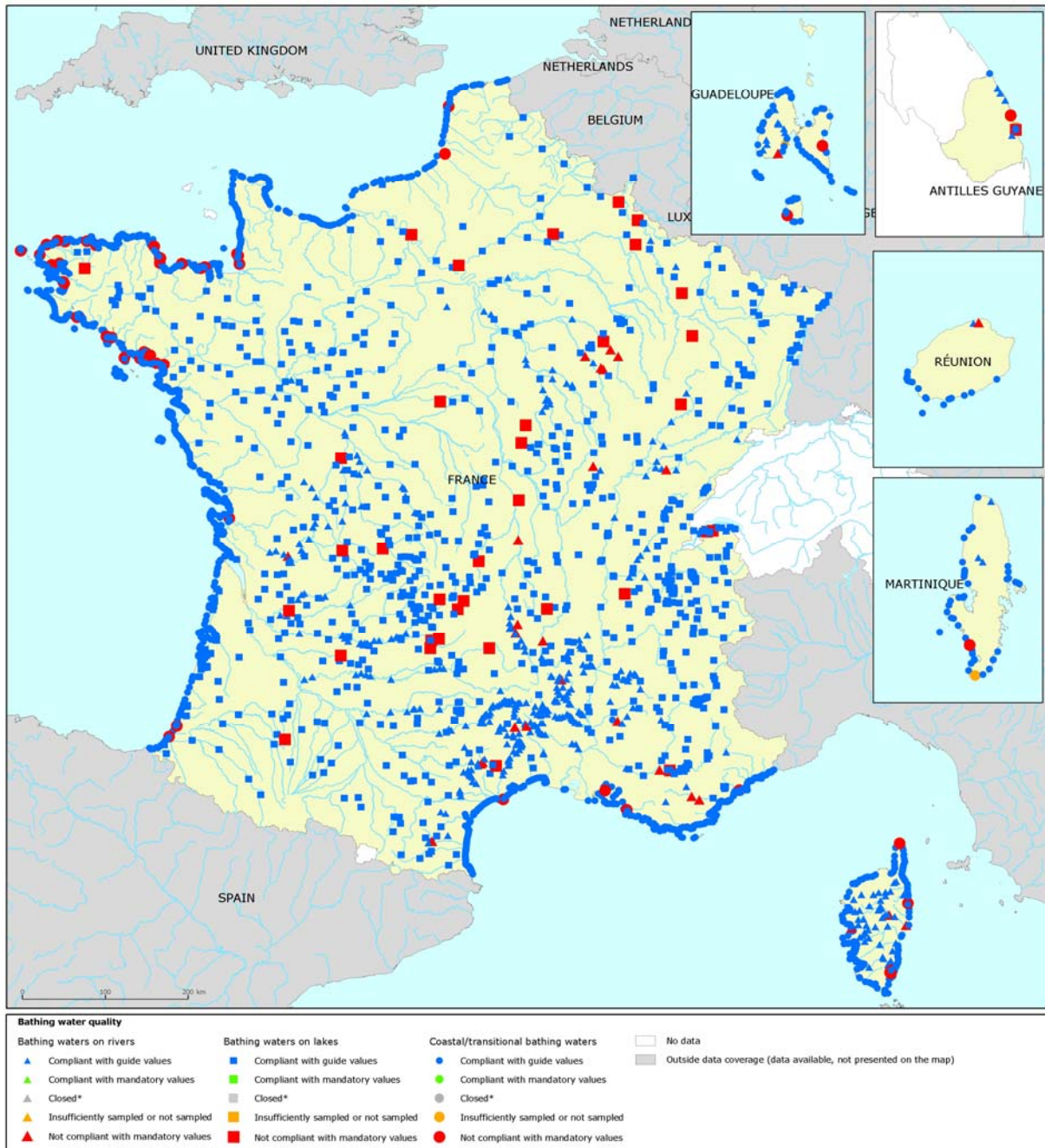
Map 1: Bathing waters reported during the 2008 bathing season in France